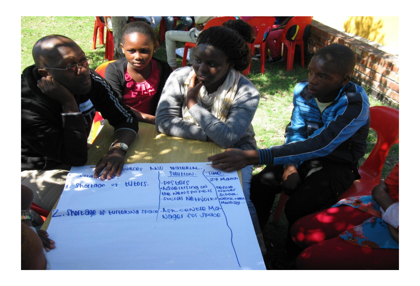
BRAINSTORMING ABOUT SOLUTIONS TO CURRENT CHALLENGES