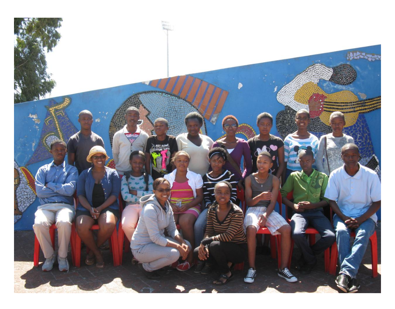
NYANGA BRANCH COMMITTEE 2013